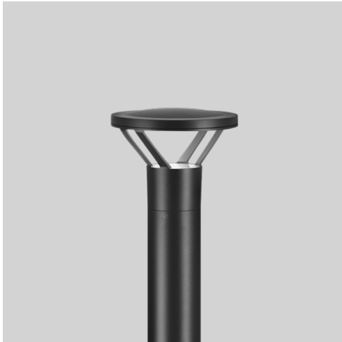
● Graphite grey RAL 7016 Fine texture