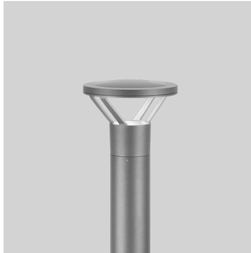
● Anthracite RAL 9023 Fine texture