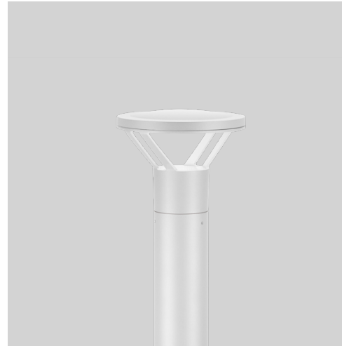
● Aluminum grey RAL 9006 fine texture