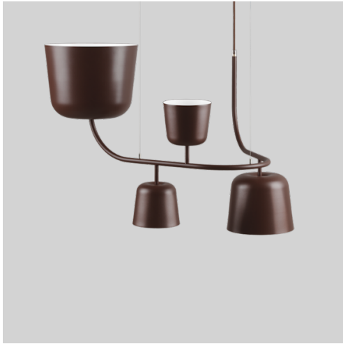
● Redbrown RAL8017