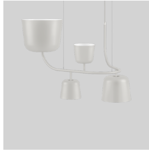
● Light grey RAL 7035