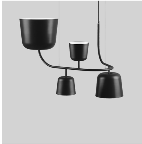
● Black RAL 9005