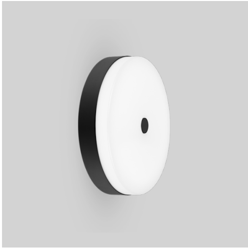
● Black Ral 9005 G10