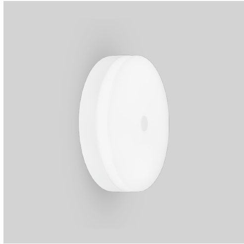
○ White Ral 9016 G10 fine texture