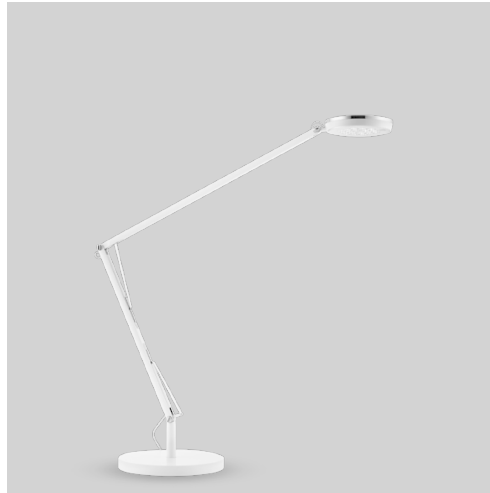
○ White RAL 9016 G20