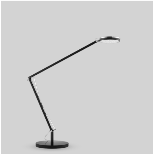
● Black RAL 9011 G20