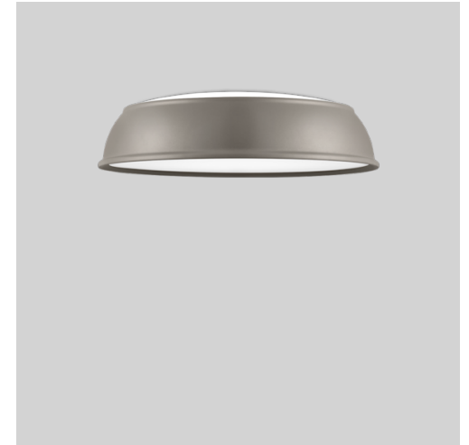
Grey NCS S 5502-Y fine texture