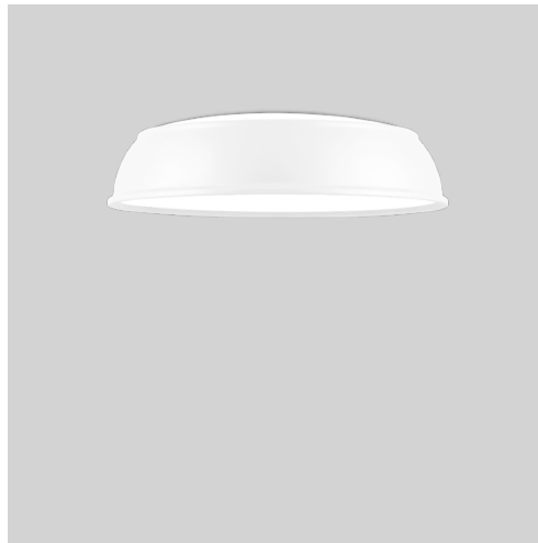
White NCS S 0500-N fine texture