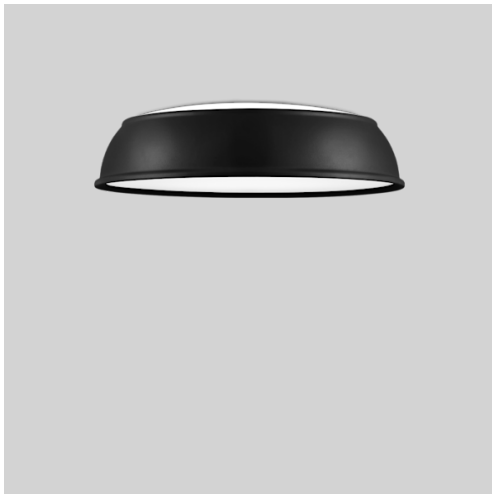
Black RAL 9005 fine texture