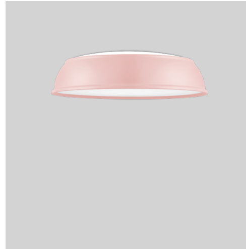
Dusty pink NCS S 1515-R fine texture