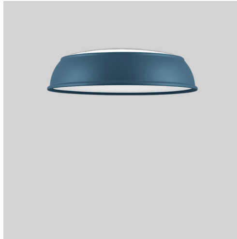
Dusty blue NCS S 6020-B fine texture