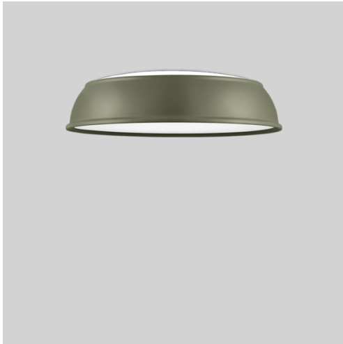
Dusty green NCS S 6010-G70Y fine texture